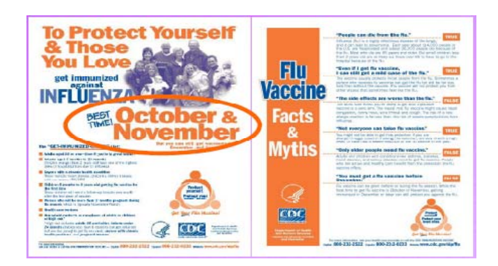
Figure 2. Flu Vaccine instructions.

The prophylaxis is vaccination (see fig 2), and it should start before the of the influenza season<sup>18,19</sup>. However, vaccine for visitors to the opposite hemisphere may not be obtainable before arrival at the travel destination. For travellers in the highest risk groups for severe influenza who have not been or cannot be vaccinated, the prophylactic use of antiviral drugs such as zanamivir or oseltamivir is indicated in available. countries where they are Amantadine and rimantadine may also be considered when the circulating strains are known to be susceptible. However, the latter drugs are not active against influenza B, and high frequencies of resistance in H3N2 and less often H1N1 viruses make then unreliable for prevention currently.